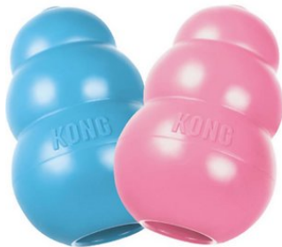
KONG Puppy Dog Toy, Small