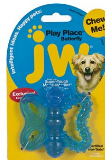
JW Pet Play Place Butterfly Puppy Teether