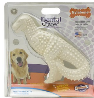
Nylabone DuraChew Dental Chew Dino Dog Toy